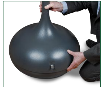
The upper part of the Drop In fixes itself with the 3 lugs. Present it vertically before rotate it clockwise until it stops 11