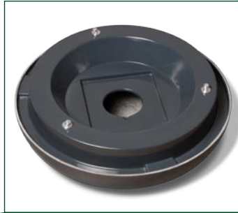
Under the container, you can either stuff the drop'in with 25 kilos of sand... 7