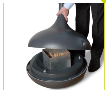
The container is easy to reach to be emptied once full (contains approximately 2500 butts) 14