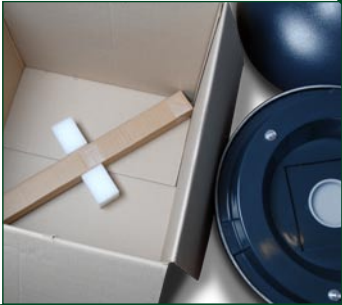
The drop'in in 3 parts (tube in the bottom) 2