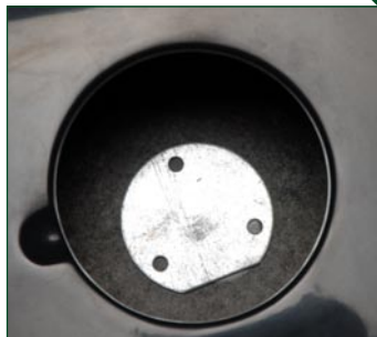
Or simply fix it to the ground (Drill 3 holes into the outside part of the container by following the 3 indicated points) 8