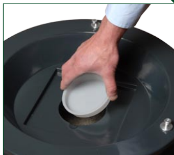
Close the container with its top 9