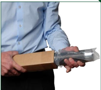
Remove the tube from its packaging 3