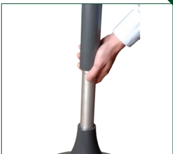
And slip the tube into the upper part 4