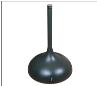
The drop'in upper part is ready 6