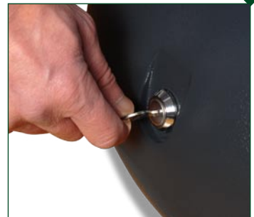
The Drop in can be locked 12