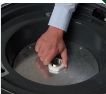
Fix the tube with the nylon nutt and turn it off tightly 5