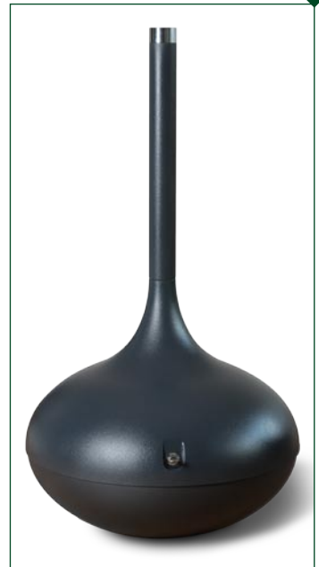
Your Drop in is ready for use 13